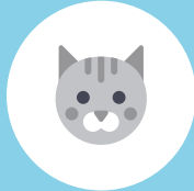
Pet Deposit/ Pet Rent