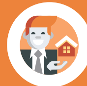
Property Manager Reliability