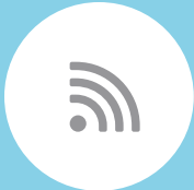
Wi-Fi and Cable